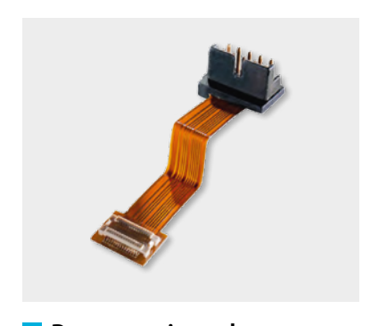
Programming adapter Programming adapter, adapted from 0.50 mm pitch to 2.54 mm pitch