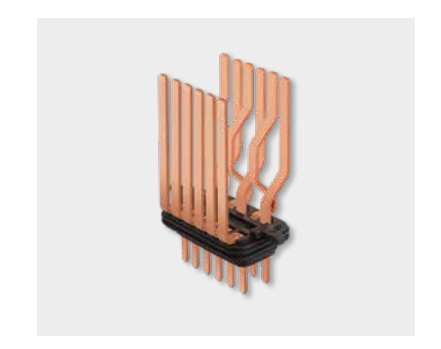
Customised connector Pin adapter with custom moulded contacts

All examples have been manufactured by mpe.