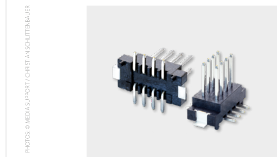
Male connector with centring pins Customised pin header with centring pins and additional solder pads