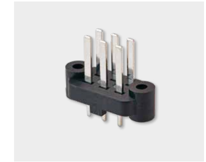
Customised connector Interface connectors with flat contacts