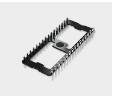
Contacting unit Contacting unit of an IC