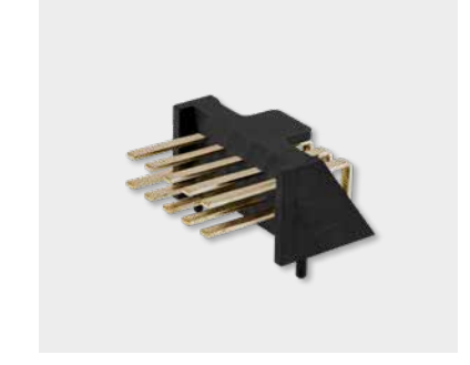
Customised connector Special plug connector, angled with suction surface and reinforced insulator