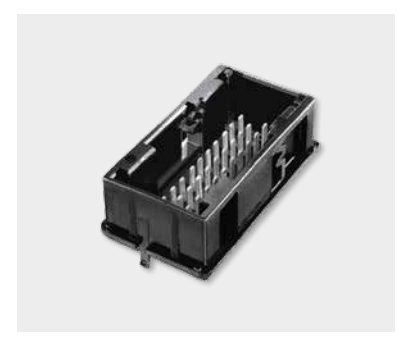
Diagnostic connector Diagnostic connector for the automotive industry