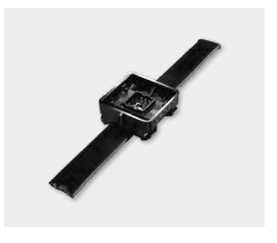
Wire piercing Light point for LED external display, contacting via wire piercing