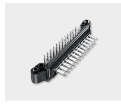
Customised connector Special connector for an ABS system in a motorbike