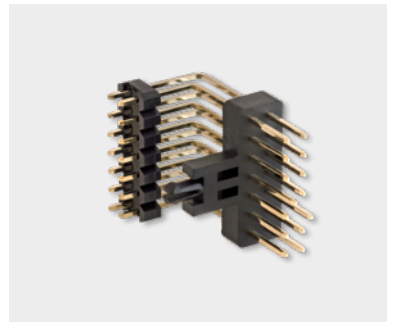
Customised connector Special pin header with leading contacts, locking device on the circuit board